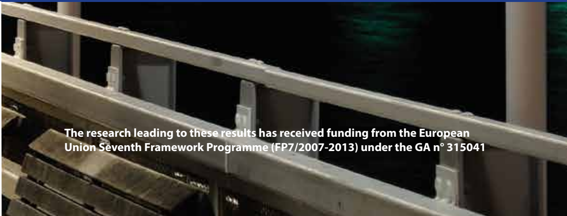
The research leading to these results has received funding from the European Union Seventh Framework Programme (FP7/2007-2013) under the GA n° 315041