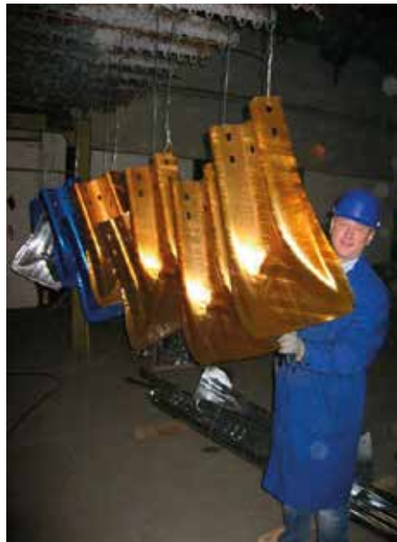
Colour sol-gel onto HDG rail ends

Innovative surface treatments will offer the market levels of wear-resistance, corrosion protection and aesthetic appearance that exceed the best standards available today.