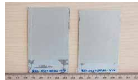
Anodised AA2024-T3 with sol-gel after 1000 hours of salt spray test

■ Application trials using the SME's substrate product are being completed either on-site at the SME or under the SME direction at the RTD.